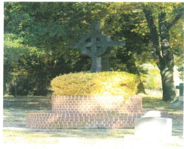
Celtic Cross Section